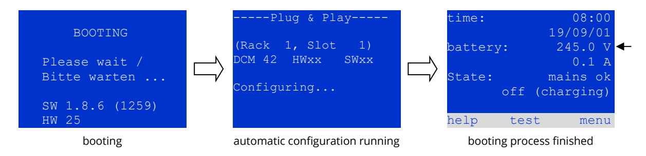
Figure 3: Booting process (left, centre) and status (right)